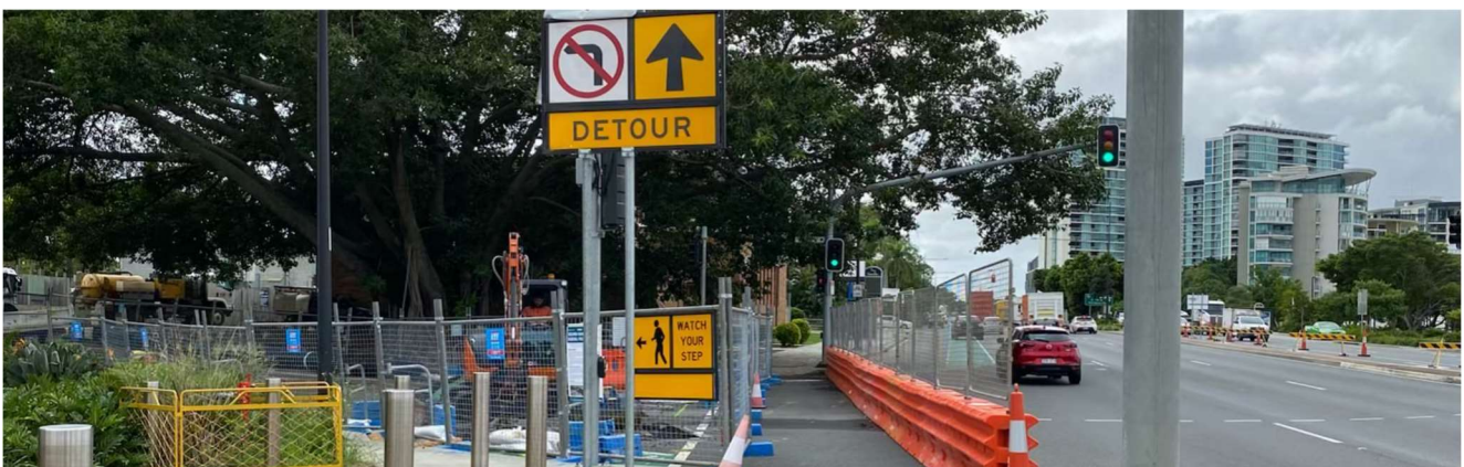
The intersection at Riverview Terrace and Kingsford Smith Drive is closed for up to 12 weeks.

At Hamilton, the temporary bypass pipeline will connect into the existing wastewater network on the northside under Kingsford Smith Drive and Riverview Terrace. To maintain the required pressure in the temporary bypass pipeline, temporary aboveground pipework is being installed at the intersection of Riverview Terrace and Kingsford Smith Drive. Works commenced on 18 March 2025 and the intersection of Riverview Terrace and Kingsford Smith Drive is now closed for up to 12 weeks, weather and site conditions permitting.