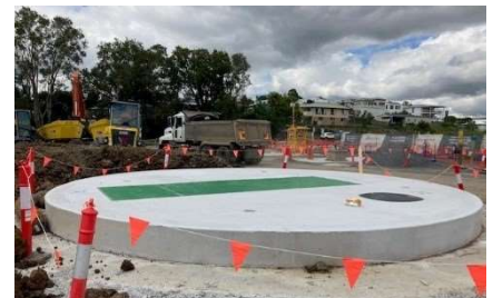
The temporary pump station tank lid.

At the end of Bolan Street, Bulimba, the team is advancing construction of the temporary pump station and connection to the main southside wastewater pipeline.